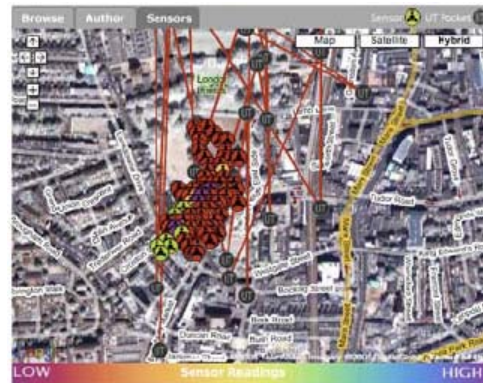
Figure 3. A visualisation of the data collected during the first London Fields trial on the Urban Tapestries platform.

product of wider participation and sense of responsibility. The vision of Robotic Feral Public Authoring is to contribute to a greater local sense of empowerment and impact of local people on environmental issues. It seeks to act as a model for how artists and engineers can collaborate to bridge the gulf between pragmatic technical solutions to social problems and the cultural interventions that artists bring to their communities. It is political in the sense that it inspires people to act; to investigate and collect evidence and use it to affect change.