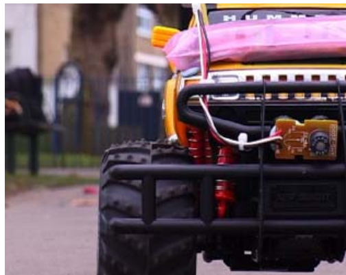
Figure 1. The prototype mobile sensor network node with carbon dioxide and air quality sensors.

We set out to investigate how toy robots can be augmented with environmental sensors and used to map pollution by grassroots communities. In the Feral Robots project (4) we have reconfigured low cost toy robots into vehicles of social and cultural activism, exploring how robotics could break out of the academic lab and how sophisticated equipment could be put into the hands of the general public by using the economies of scale of consumer manufacturers. In our current work we have designed and implemented a new generation of this technology and the software needed to enable it to sense pollution, add GPS location data and feed this back to the Urban Tapestries mapping platform.